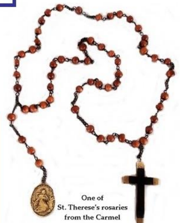
One of St. Therese's rosaries from the Carmel